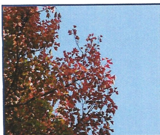
Drummond red maple